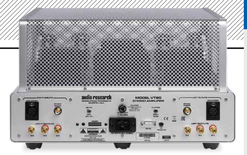
ABOVE: Balanced (XLR) and single-ended (RCA) inputs are selected by a toggle and separate 8/4ohm speaker taps are offered on 4mm terminals. Note the 15A blade-style mains inlet and second toggle to facilitate auto shut-off, preserving valve life

had a particularly infectious flow. Then tracks by The Detroit Emeralds and The Hues Corporation allowed analogue and digital comparisons. Namely: 'Feel The Need' [Greatest Hits, Westbound CDSEWD 119 (CD); Feel The Need Atlantic K50372 (LP)] and 'Rock The Boat' [The Very Best Of The Hues Corporation, Camden 74321 603422 (CD); Freedom For The Stallion RCA APL 1-0323 (LP). So wide is the dynamic span, so free of 'clutter' the presentation that A/B comparisons of CD vs LP were accomplished with unmistakable consistency and lucidity.